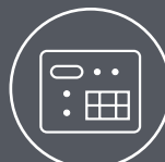
Industrial machinery and equipment