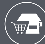
Wholesale trade durable goods